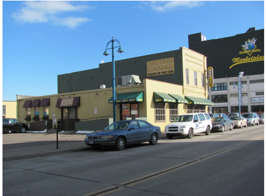
Subway and Salon/Day Spa

Canal Park Square is located in Duluth's scenic Canal Park, Lake Superior harbor. This is a thriving hotel, sports, convention, entertainment and restaurant area in northern Minnesota. A great location for retailers, restaurants and businesses! The famous Aerial Life Bridge is just two blocks away. The buildings are 100% leased, including six residential apartments above Green Mill. The second building includes Subway and a Salon as tenants. The sale price for both buildings is $2.2 million and also includes a parking lot between both buildings.