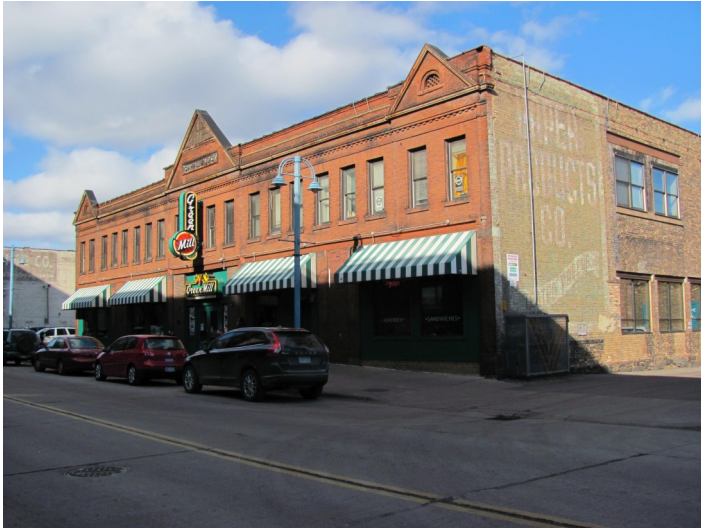
340 Building and Apartments